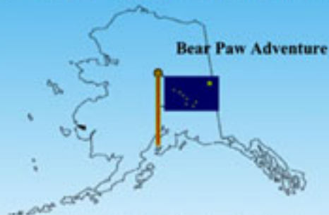
Bear Paw Adventure

www.bearpawadventure.com Email: Alaska@bearpawadventure.com